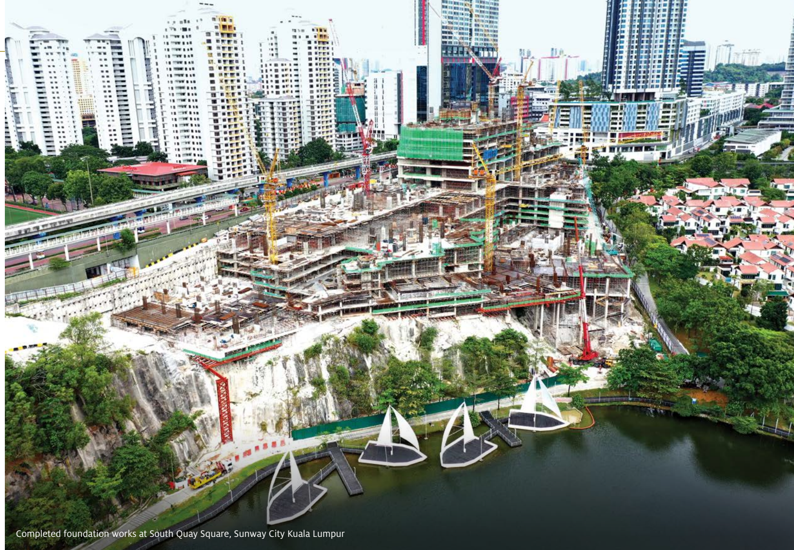
Completed foundation works at South Quay Square, Sunway City Kuala Lumpur

• 4 projects completed in 2022 Total contract value RM17 million